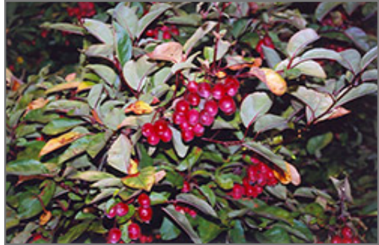
Adams Flowering Crab fruit

This tree should only be grown in full sunlight. It prefers to grow in average to moist conditions, and shouldn't be allowed to dry out. It is not particular as to soil type or pH. It is highly tolerant of urban pollution and will even thrive in inner city environments. This particular variety is an interspecific hybrid.