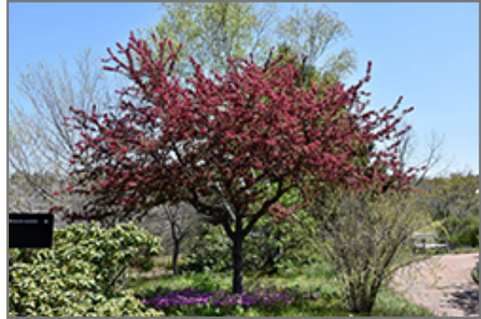
Adams Flowering Crab in bloom

This tree will require occasional maintenance and upkeep, and is best pruned in late winter once the threat of extreme cold has passed. It is a good choice for attracting birds to your yard. It has no significant negative characteristics.