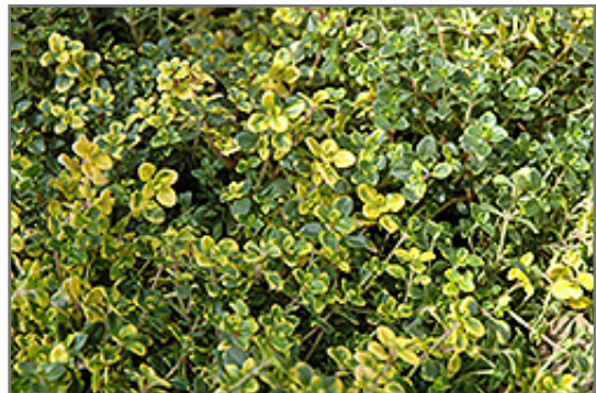
Doone Valley Thyme