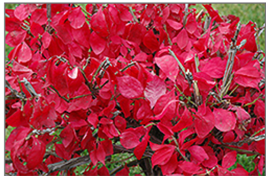
Dwarf Winged Euonymus in fall