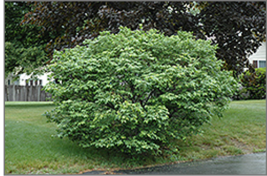
Dwarf Winged Euonymus

This shrub performs well in both full sun and full shade. It is very adaptable to both dry and moist locations, and should do just fine under average home landscape conditions. It is not particular as to soil type or pH. It is highly tolerant of urban pollution and will even thrive in inner city environments. This is a selected variety of a species not originally from North America.