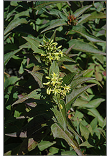
Butterfly Bush Honeysuckle flowers

Butterfly Bush Honeysuckle is recommended for the following landscape applications;