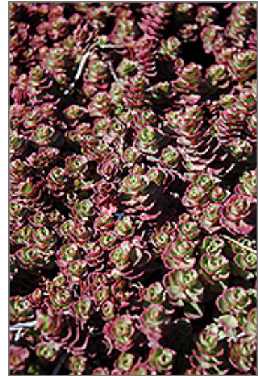
Red Carpet Stonecrop foliage

Red Carpet Stonecrop is a dense herbaceous perennial with a ground-hugging habit of growth. It brings an extremely fine and delicate texture to the garden composition and should be used to full effect.