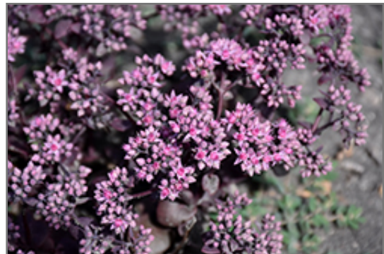
Red Carpet Stonecrop flowers