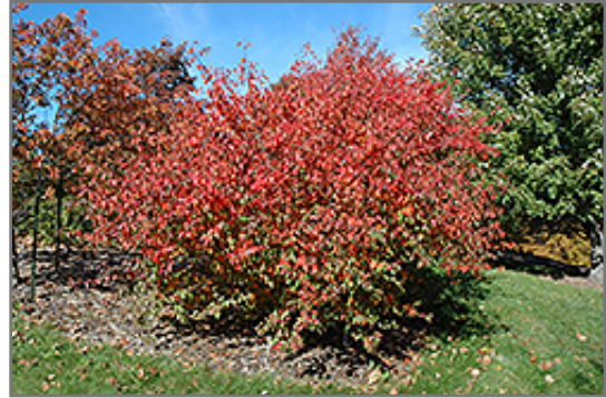
Korean Sun Pear in fall