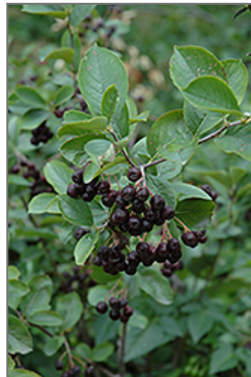
Black Chokeberry fruit