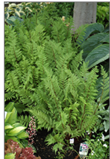
Lady in Red Fern