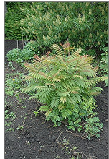
Sem Falsespirea