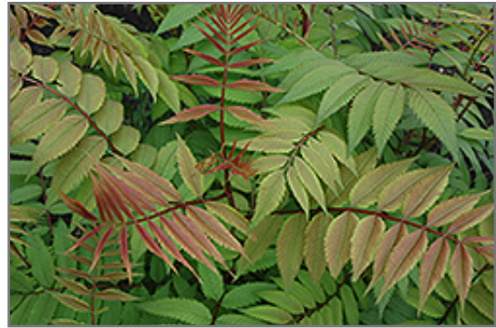
Sem Falsespirea foliage

This shrub will require occasional maintenance and upkeep, and is best pruned in late winter once the threat of extreme cold has passed. Gardeners should be aware of the following characteristic(s) that may warrant special consideration;