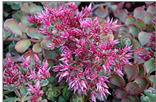
Fulda Glow Stonecrop flowers