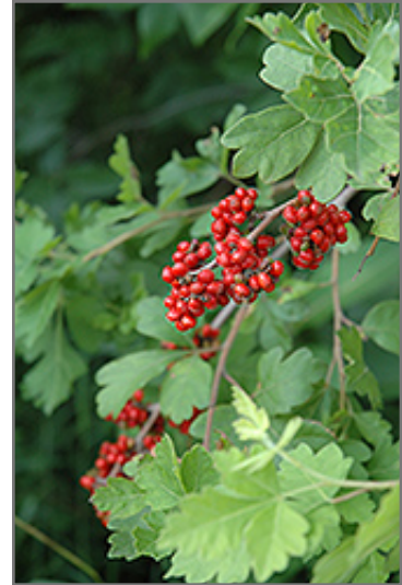
Fragrant Sumac fruit