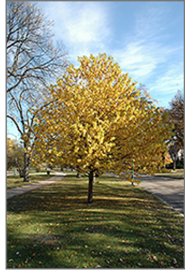
Amur Cherry in fall

This tree should only be grown in full sunlight. It does best in average to evenly moist conditions, but will not tolerate standing water. It is not particular as to soil type or pH. It is somewhat tolerant of urban pollution. This species is not originally from North America.