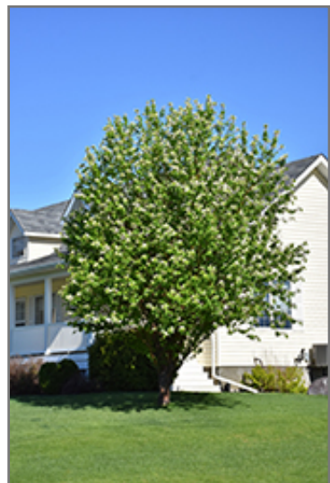
Amur Cherry