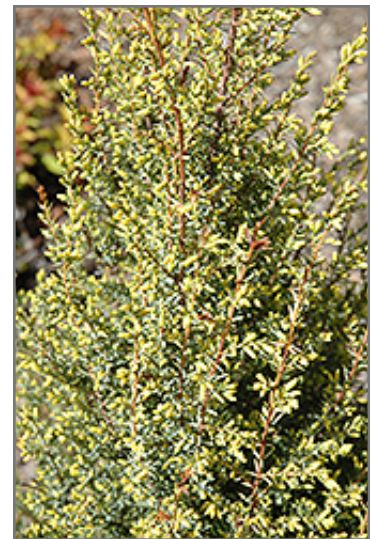
Gold Cone Juniper foliage