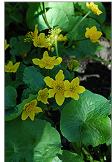
Marsh Marigold flowers