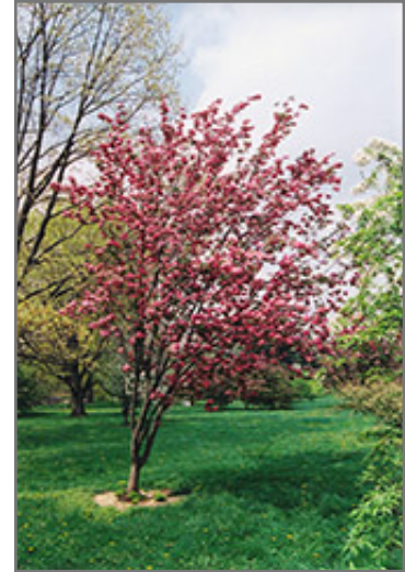
Red Baron Flowering Crab flowers

Red Baron Flowering Crab is recommended for the following landscape applications;