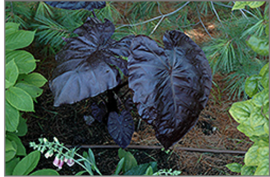
Royal Hawaiian Black Coral Elephant Ear

Royal Hawaiian Black Coral Elephant Ear is recommended for the following landscape applications;