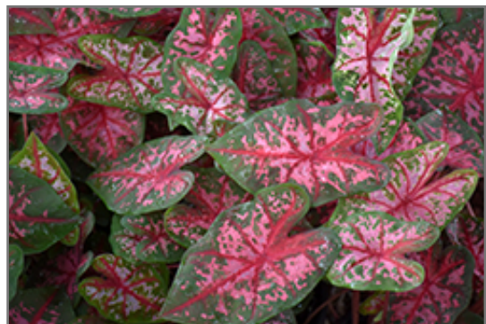
Carolyn Whorton Caladium foliage