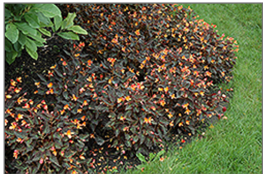
Sparks Will Fly Begonia in bloom