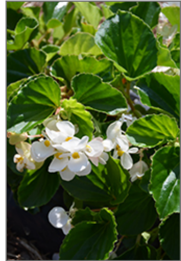
BabyWing White Begonia flowers