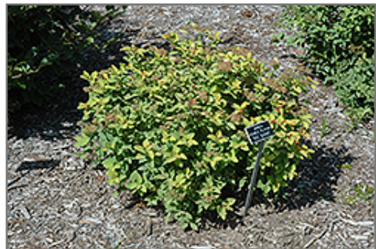
Double Play Big Bang Spirea