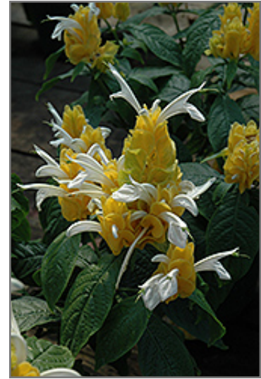
Golden Shrimp Plant flowers

Golden Shrimp Plant is recommended for the following landscape applications;