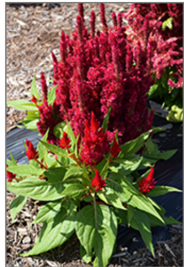
Fresh Look Red Celosia in bloom