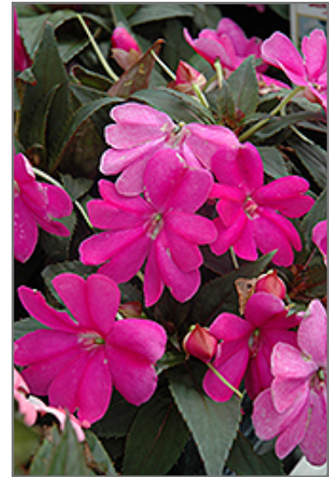
SunPatiens Compact Lilac New Guinea Impatiens flowers

SunPatiens Compact Lilac New Guinea Impatiens is recommended for the following landscape applications;