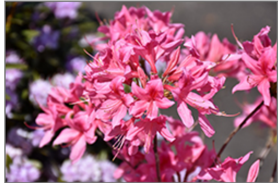
Rosy Lights Azalea flowers

Rosy Lights Azalea is recommended for the following landscape applications;