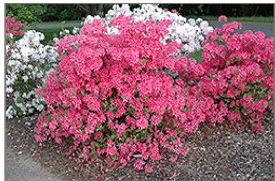
Rosy Lights Azalea in bloom