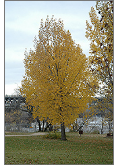
Siouxland Poplar in fall